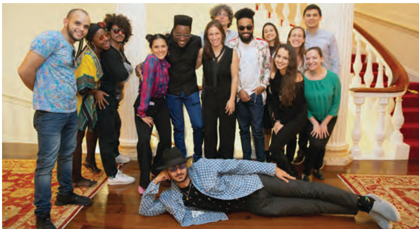
UNPLUGGED: FREESTYLING WITH CUBA'S CIMAFUNK, A YOUNG PROFESSIONAL OF THE AMERICAS EVENT AT AMERICAS SOCIETY, APRIL 15, 2019.

Young Professionals of the Americas (YPA) is an international network that provides a platform for young professionals in their 20s and 30s to connect around the latest trends in the Americas through its New York City, Miami, and Washington D.C. chapters. Members come from various nationalities and represent a diverse spectrum of professional sectors, including venture capital and finance, fashion, government, non-profit, design, consulting, law, and the arts. Membership includes exclusive access to panels, discussions, networking, and social events, such as talks with government officials and industry leaders, private gallery tours, and happy hours.