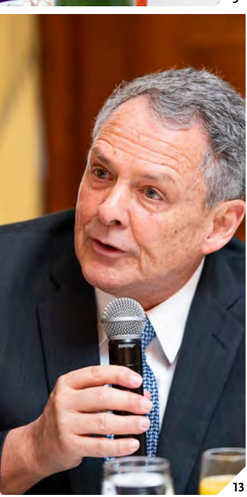
7/ Horacio Rodríguez Larreta, Mayor of the City of Buenos Aires, Argentina